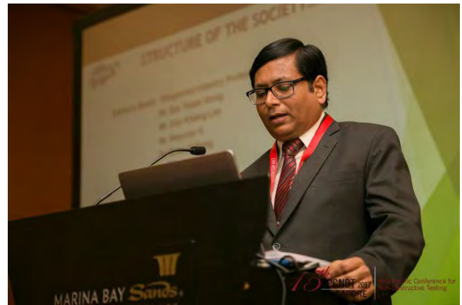
Personnel Certification Workshops & Forumn