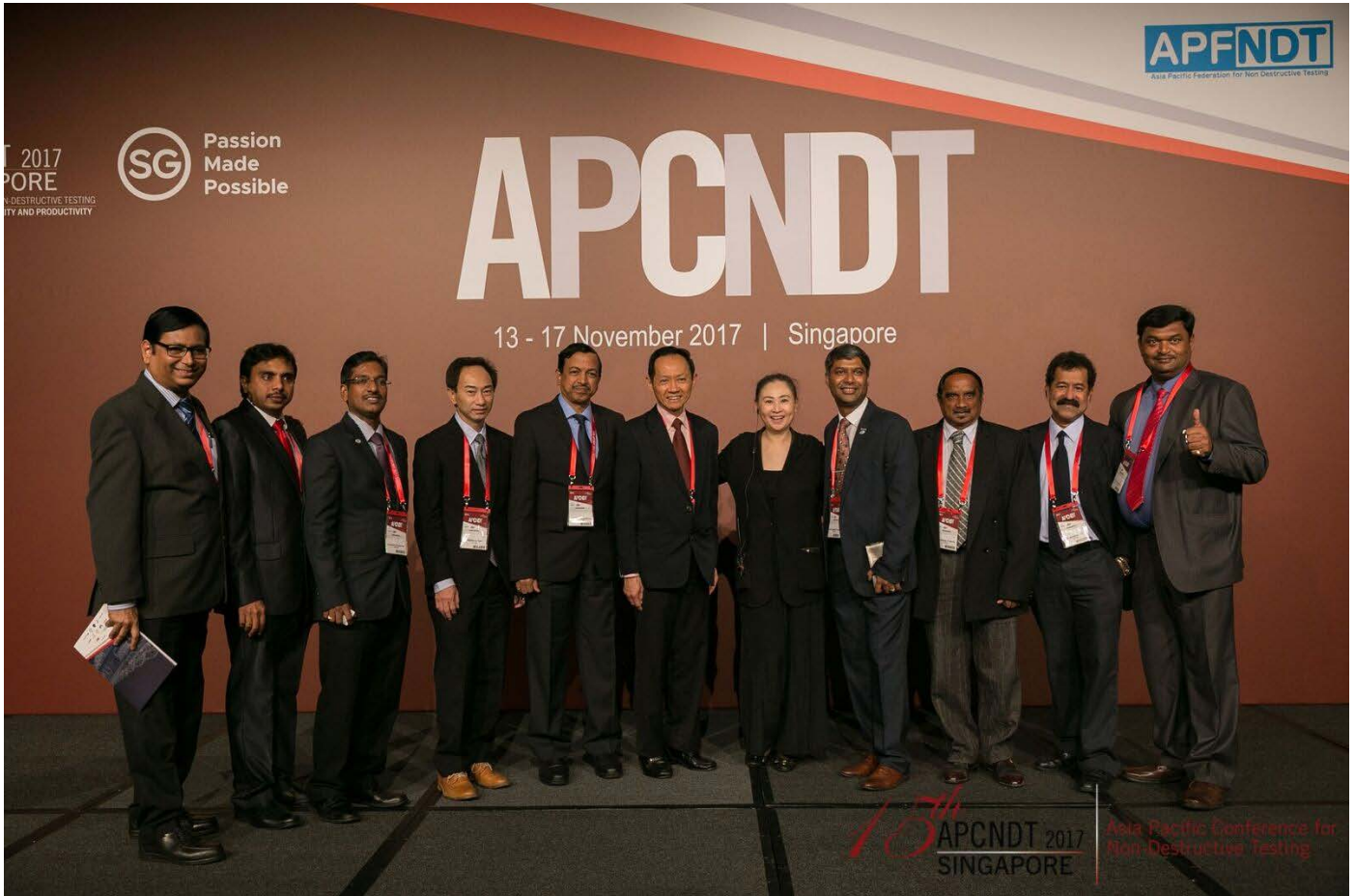
NDSS Organizing Committee for 15 th APCNDT 2017.