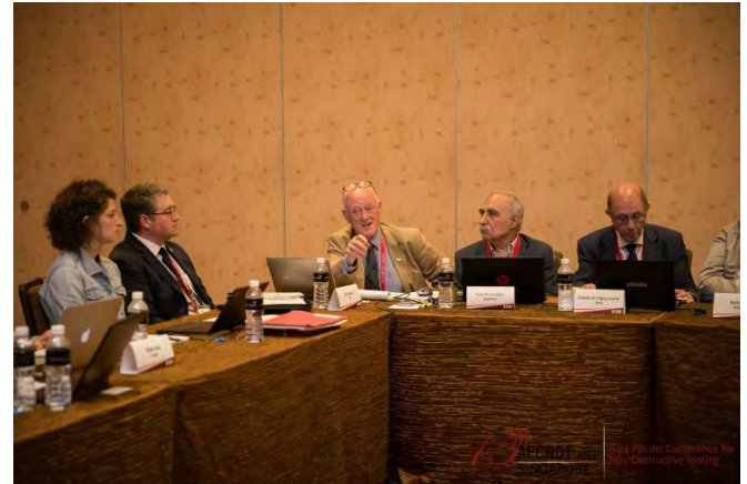
Meetings & Forum