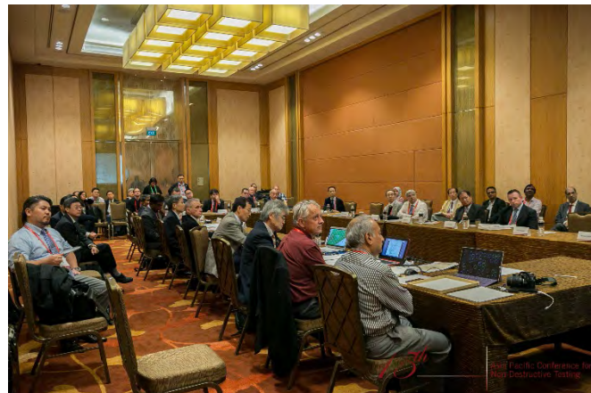
APFNDT Board Meeting & Annual Meeting