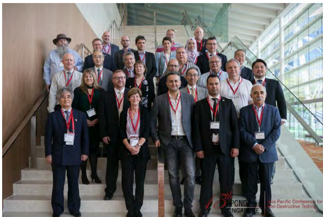
ISO Technical Committee Meeting