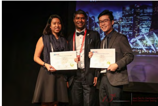
Receipents of Certificate holders

NDTSS has presented its first ISO 9712 Certification during the conference, the certification is achieved as a result of mixed Intergrated Work Study programme (IWSP) developed by Singapore Institute of Technology (SIT) & NDTSS. This program is first in the region, expect to attract young graduates to the industry.